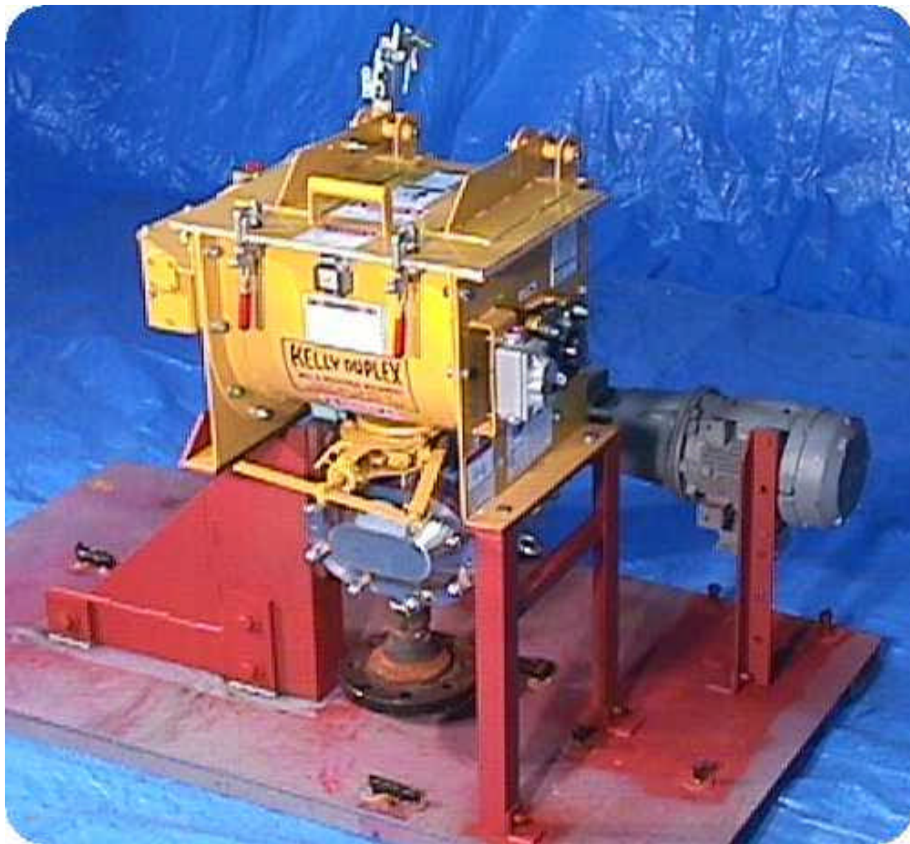
Model 131.5 paddle / plow mixer mounted to Sun Chemical pump